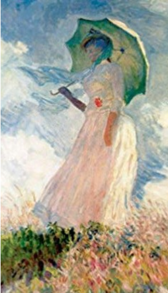
Study of a Figure Outdoors: Woman with a Parasol, facing left, 1886. Claude Monet